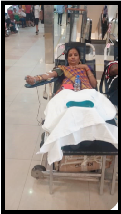
Apexian Saras of Apex Kuala Lumpur participating in their club's blood donation drive

Type to enter textThe club donated 13 sets UPSR workbooks (5 books each set) and 4 football to SJK (T)