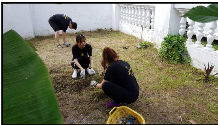
Gotong-royong in HCK home