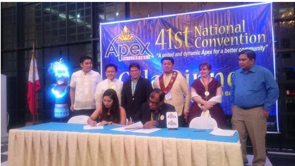
Signing twinning agreement between Apex Club of Malacca Central and Apex Club of San Pablo

When I first joined Apex way back in 1976, I was immersed only with doing service to the local community. This, to me, was what attracted me to Apex in the first place....doing altruistic service to the needy. That is only part of the Third Ideal of Apex. The Third Ideal also enjoins one to form enduring friendship. This then leads us to promoting international understanding and friendship! The Fourth Ideal.