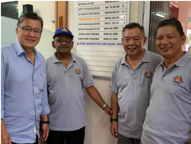
Team PJ proudly posing by the roll of honour displaying our donation

Jaya to Kuala Selangor to ease transportation and logistics for the day. In fact, the idea of traveling together also made everyone excited and helped build momentum and mood of all Apexians.