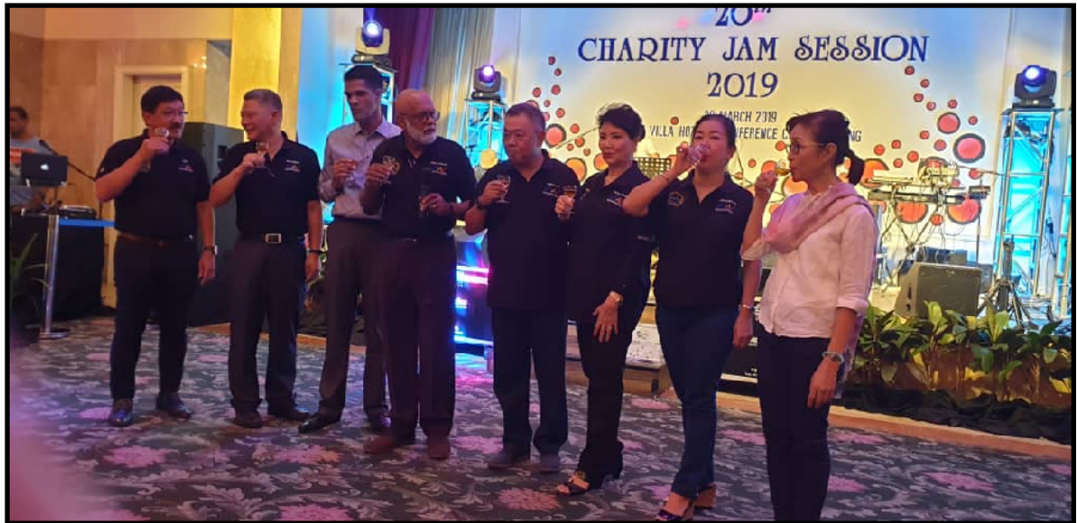
Charity Jam session 2019 in Holiday Villa, Subang