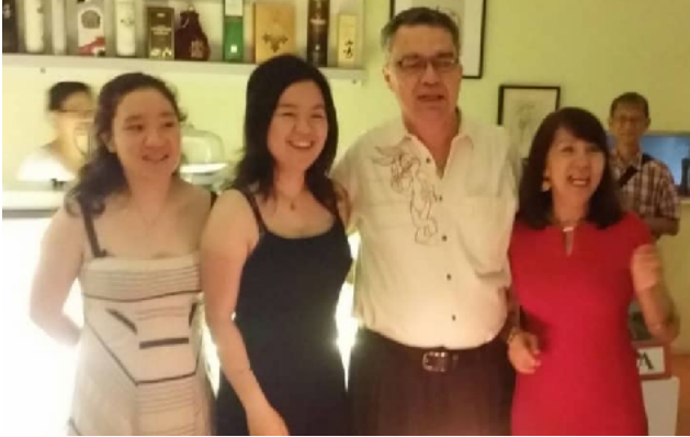
The women that complete my life

It was a very enjoyable and memorable occasion.