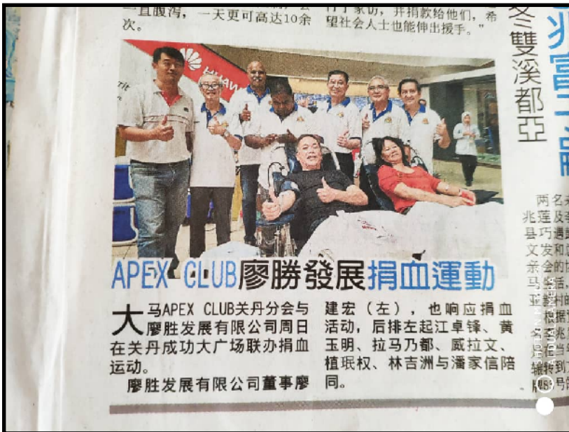
Kuantan's Bloody Donation drive which was featured in local newspaper