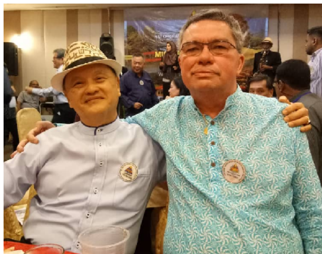
Great fellowship with a fellow great Apexian

days the Apex Club of Ipoh had their dinner meetings on the 1st & 3rd Thursdays of the Month at the Royal Ipoh Club. I was considered a young 'chicko' and most of the members very much older than me. It was my association with them that I considered myself maturing faster than the other people in my age group. My draw into the Apex Movement was due to the warmth and fellowship and the dedication of the