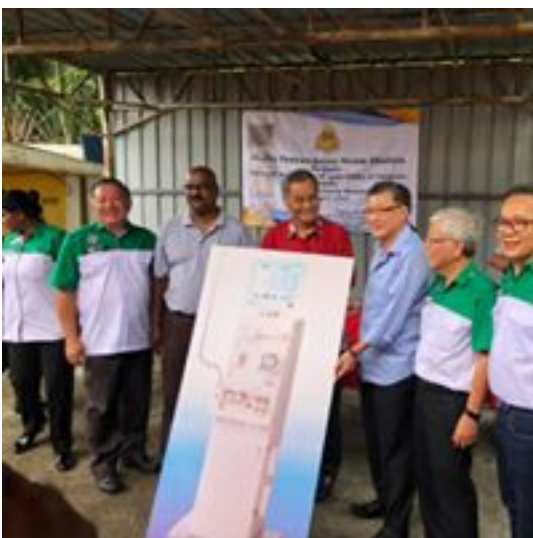
Presentation of mock dialysis machine

Upon announcing this project around December, we requested all clubs to assist in raising funds to make this dream a reality. We were fortunate to receive contributions from most Apex Clubs in Malaysia, Apex Australia, Global Chairman Eshwar, friends, supporters and good Samaritans. After a couple of months of fund raising, we achieved the RM40,000.00 target which is the amount needed to purchase the machine. The machine procured was of Nipro brand as all machines there are of the same brand and it would be easier for