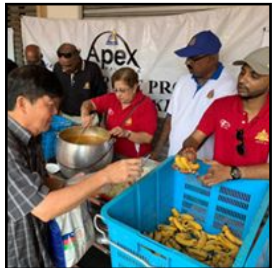
Apex Klang participated in soup kitchen for homeless in Jalan Masjid India, Kuala Lumpur