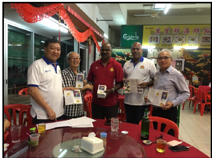
Apex Kuantan Dinner Meeting which drew a very large crowd