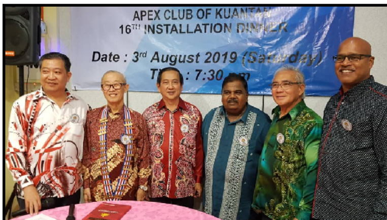
Apex Kuantan's installation dinner