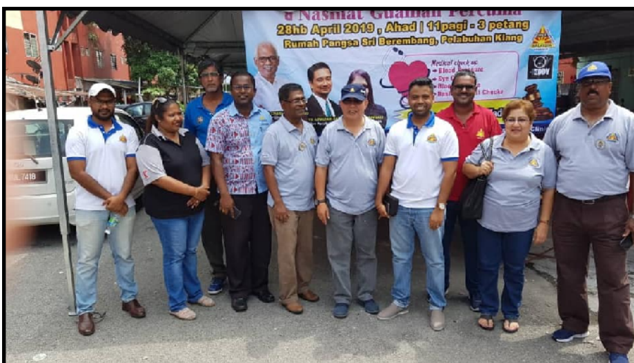
Apex Klang organised a Medical and Legal Camp together with Teddy's Mobile Clinic and Selangor bar Legal Aid