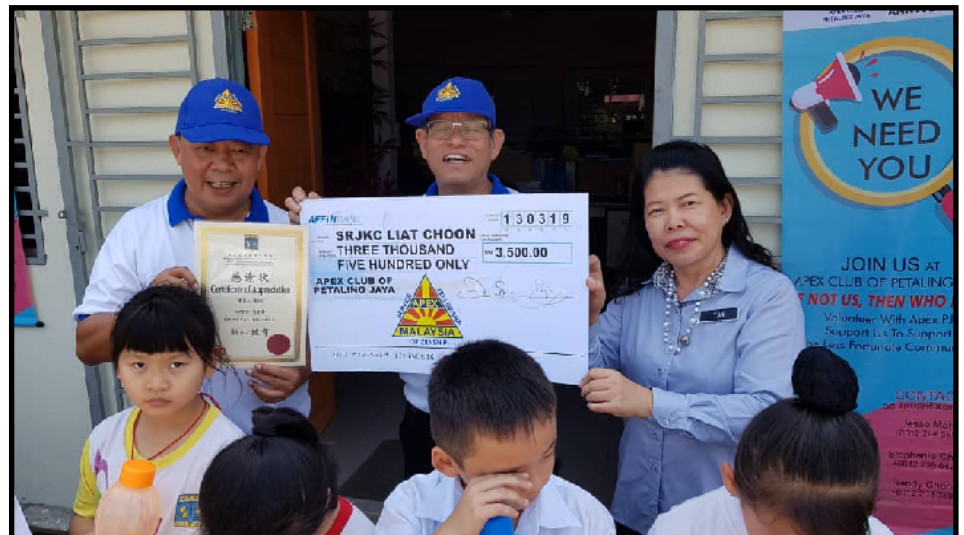
Bursary presentation for students of SRJK (c) Liat Choon

The 62 nd Annual Bursary Presentation was held on 16 March 2019 at SMK Pendidikan Khas, Setapak, Kuala Lumpur together with . As usual the club organised public speaking competition to encourage and develop the student’s communication skills during this bursary. A total of 21 bursaries been awarded to the students from different secondary schools in the Klang Valley which amounted to RM 9,250.00