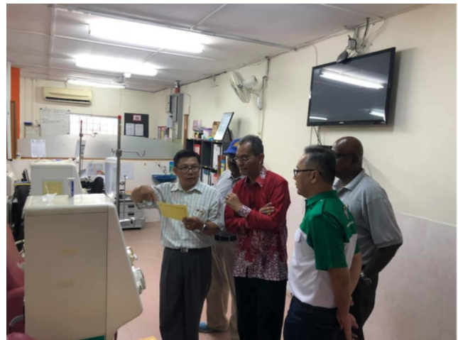
Hon Minister being briefed on the usage of the dialysis machine

The National Board in its first meeting after 2018 National Convention discussed many things and of course service projects was one of the most hotly debated matters apart from membership expansion. After much deliberation and research it was decided around November 2018 that we would sponsor a dialysis machine for a dialysis