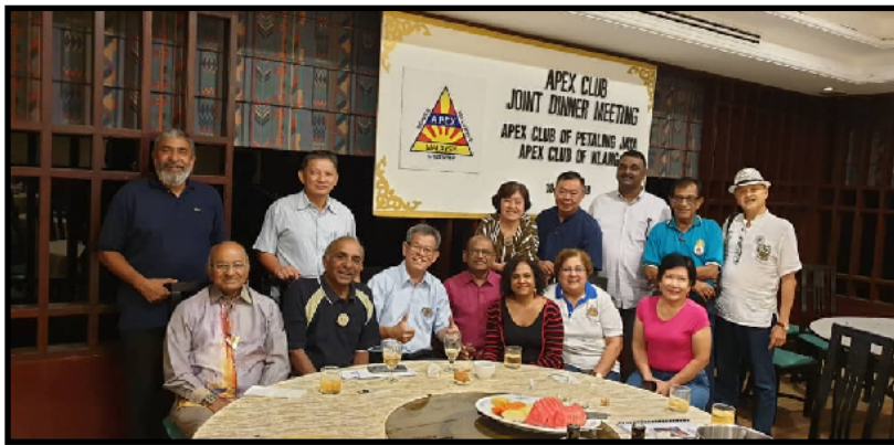
Apex Club Joint Dinner Meeting organised by Apex PJ and Apex Klang