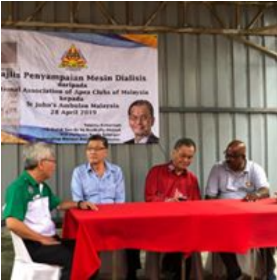
NP Sri explaining to Hon Minister on our projects and activities

Why did we choose this programme? It is to be noted that almost 7000 people are diagnosed with renal failure annually and unfortunately most of them are of the lower income bracket. Most patients are unable to afford the high cost of treatment and depend on the highly subsidized treatments offered by the centres run by SJAM. It is with this in mind that the National Board decided to donate a machine to be placed at the