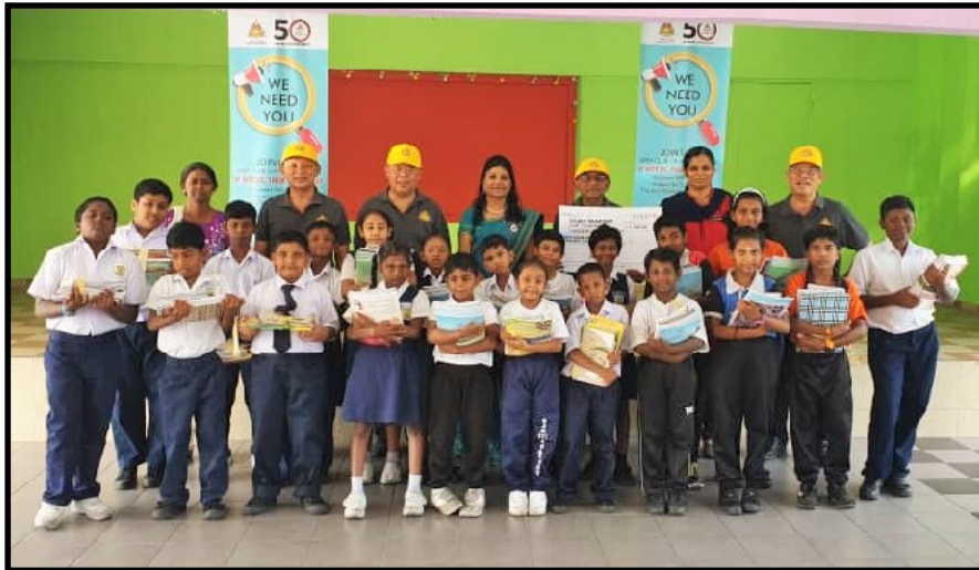
Bursary presentation in SK Seaport