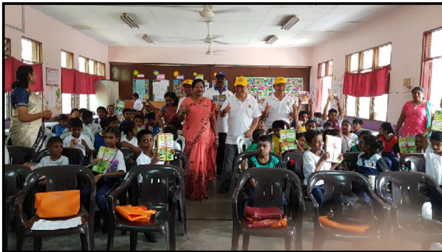
Bursary presentation in SJK(T) Seafield