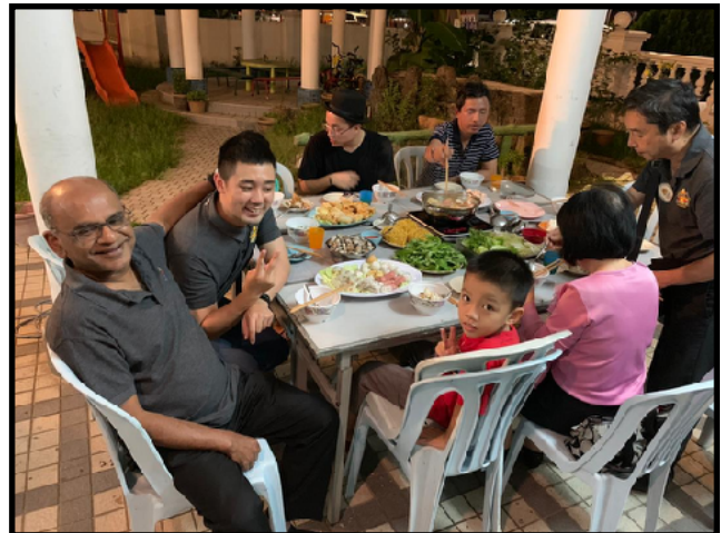
Apex PJ steamboat fellowship with HCK inmates