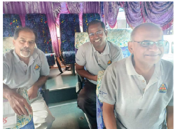
On the bus ride to the programme

Overall, it was a great event with fantastic results with many people who attended on