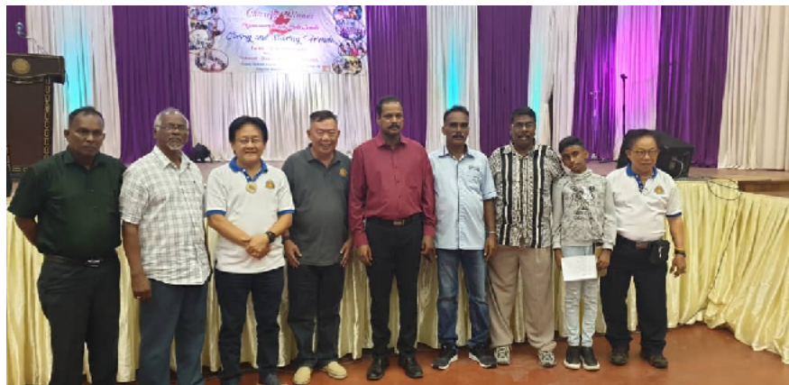
Single Parent's Home Sg Siput charity dinner