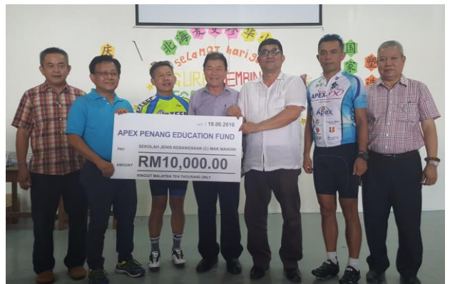
Apex 850 Mock Cheque presentation to SMJK © Mak Mandin in 2016

Apex Club of Penang hosted the National Conventions 5 times, 1978, 1990, 1996, 1999 and 2007. We will be hosting the National Convention again in 2020 in conjunction with the 50th Anniversary of Apex Club of Penang. We all hope and pray the Covid 19 will ease off by next year.