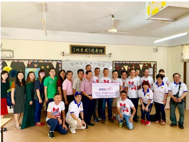
Apex 850 cyclist and Apexian at the presentation ceremony, SJK(C) Yit Min, Changlun

With all the five editions, Apex 850 raised RM 660,000 for the Apex Penang Education Fund. A total of RM 79,780 was given to 10 students as scholarship for their tertiary education. Besides making a difference in the lives of these recipients it has provided financial assistance to a multitude of deserving students from disadvantaged backgrounds.