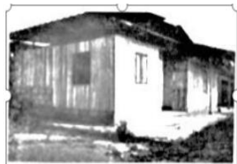
Dwelling for Cured Leprosy Patient