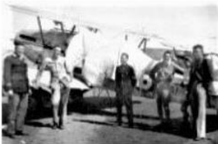
Flying Doctors Service

Moving on to Malaysia, the Apex Club of Kuala Lumpur which was formed in 1957 undertook a service project in 1957 just after its inauguration. This was the timber layering on a concrete base for the home of a Chinese family of ten in Jinjang. The breadwinner was semi-paralysed, while the wife suffered from tuberculosis. The finished floor provided the family with a dry floor for the first time in many years .