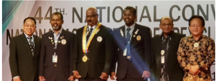
Editor with National Board 2020/2021

I am very excited to announce the release of first and only issue of our Malaysian Apexian Magazine 2019-2020.