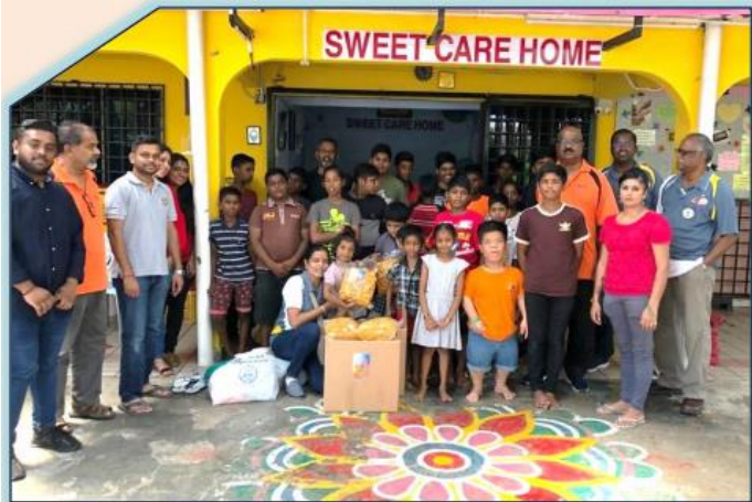
Distribution of snack to children home. Happy to see the smiling faces.