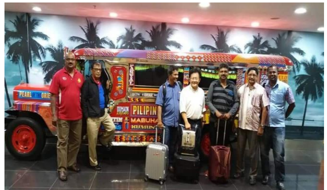
Things end but memories last forever