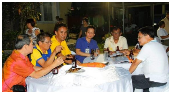
Pre-social at Philippines Convention.

Anyway, that was not a damper! As the night wound down, we were all boozed to the hilt and it was time to hit the sack. Was it the beers or the comfortable feeling that you are back home in your own bed? Sleep came within seconds.