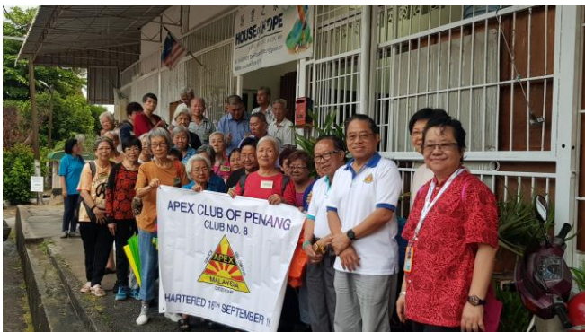
Apex Club of Penang & kind friends sponsored 40 senior citizen for Day Tour of Lake Garden Taiping just before lockdown.