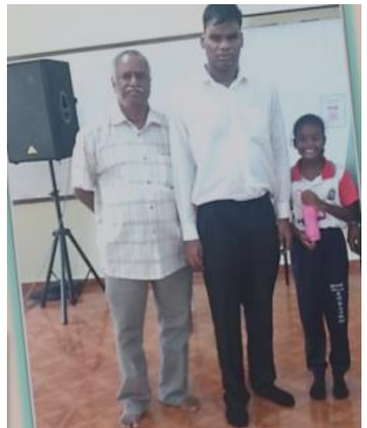
Service Project - Provide School Uniform And Shoes to students from Anbu Illam.