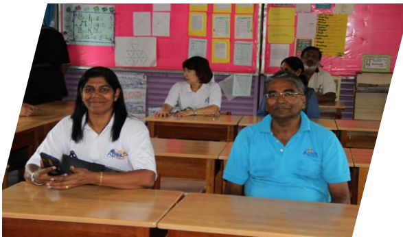
New desk and chair for SJK(C) Yit Min, Changlun

In 2018 from 20th to 24th September, 20 cyclists from Singapore, Thailand and Malaysia embarked on a 950 kilometer ride from Penang via Banding, Kota Bahru, Gua Musang, Cameron Highlands and back to Penang.