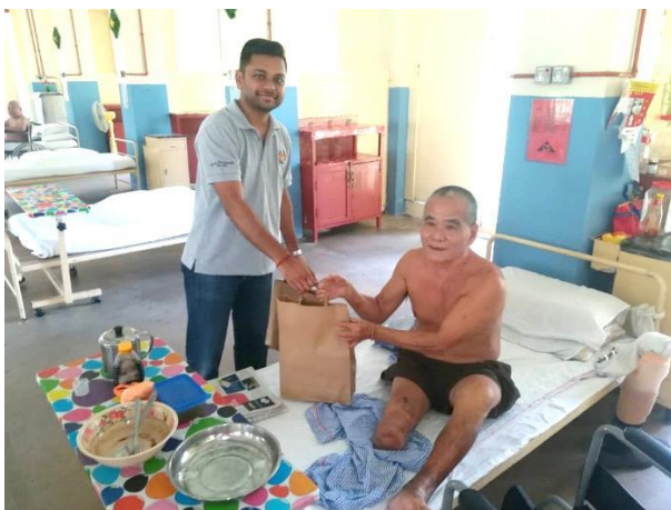
One of the senior citizen receiving the goody bag.