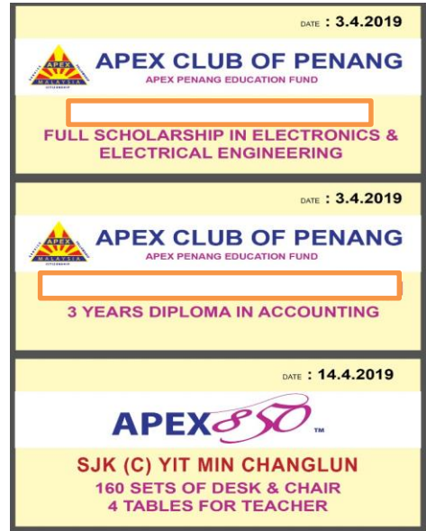
Beneficiaries of APEF

The 4th Annual Edition of Apex 850 was from 30th October to 5th November 2016 and it created a number of records, the distance covered was 1,500km with 30 riders for 7 days from Singapore to Phuket, Thailand via Malacca, Klang, Sungai Siput, Alor Star, Trang and Krabi.