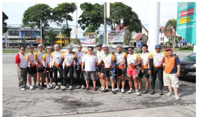
Apex 850 cyclists preparing for the trial ride

2015 Apex 850 was different, unlike previous years the version was divided into two events due to unavoidable circumstances that Apex 850 Singapore edition, Kota Bahru to Singapore on May 28-31 and the second edition Phuket to Penang on August 27 th -30 th . The Singapore edition was extremely successful. The Penang edition started from Phuket via Surat Thani, Nakhon Si Thamarrat, Hadyai to Penang.