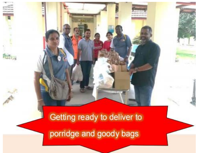
Getting ready to deliver to porridge and goody bags