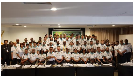
National Mid-Term Meeting 2019-20 Cinta Sayang Resort, Sungai Petani

Due to overwhelming support on articles from many clubs, I have managed to condense and publish this issue of magazine for your reading pleasure. The soft copy is circulated to our members having e-mails.