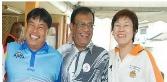
Fellowship with Apexian at Philippines Convention .

following and keeping an eye on you, among others (sic), at all times. It boils down to logistics and the planning.